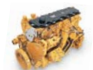
CAT C7 Diesel