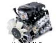
Vortec 6.0L Gas