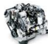
Duramax 6.6L Diesel