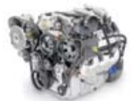
Vortec 8.1L Gas