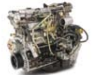
Isuzu 4H Diesel