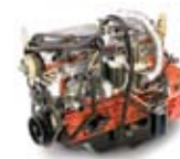
Isuzu 6H Diesel