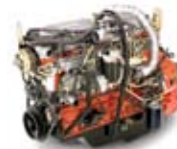
Isuzu 6H Diesel